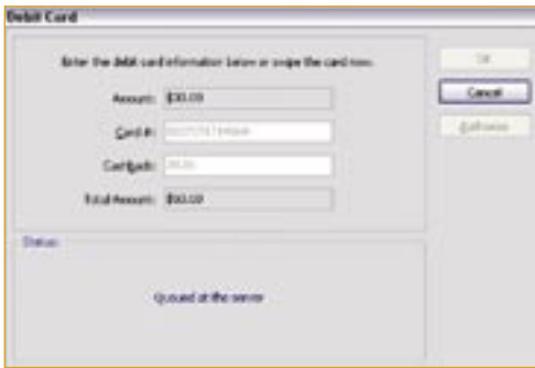
It's also easy to accept debit cards with just one approval screen.

When you process a PIN debit transaction, a simple screen appears in your QuickBooks Point of Sale software. Simply enter the amount of the sale, plus the amount of any cash back, and click "OK." The customer enters his or her PIN in the optional PIN pad, and the sale is processed.