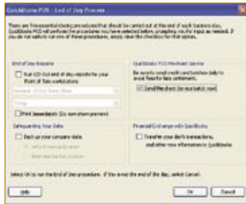
One click and your settlement is done for you!

In your QuickBooks Point of Sale software, simply make sure the "Send Merchant Service batch now" box is checked. It's located in the QuickBooks POS Merchant Service section of the End of Day Process screen. Click "Okay," and your settlement is done—saving you hours of work each month!