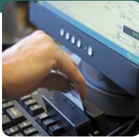
Our easy-to-use card reader plugs right into your PC.

Our optional card reader plugs right into your computer and costs only $89—compared to credit card terminals which can cost $1,000 or more! Also, we have no terminal leases or maintenance fees.